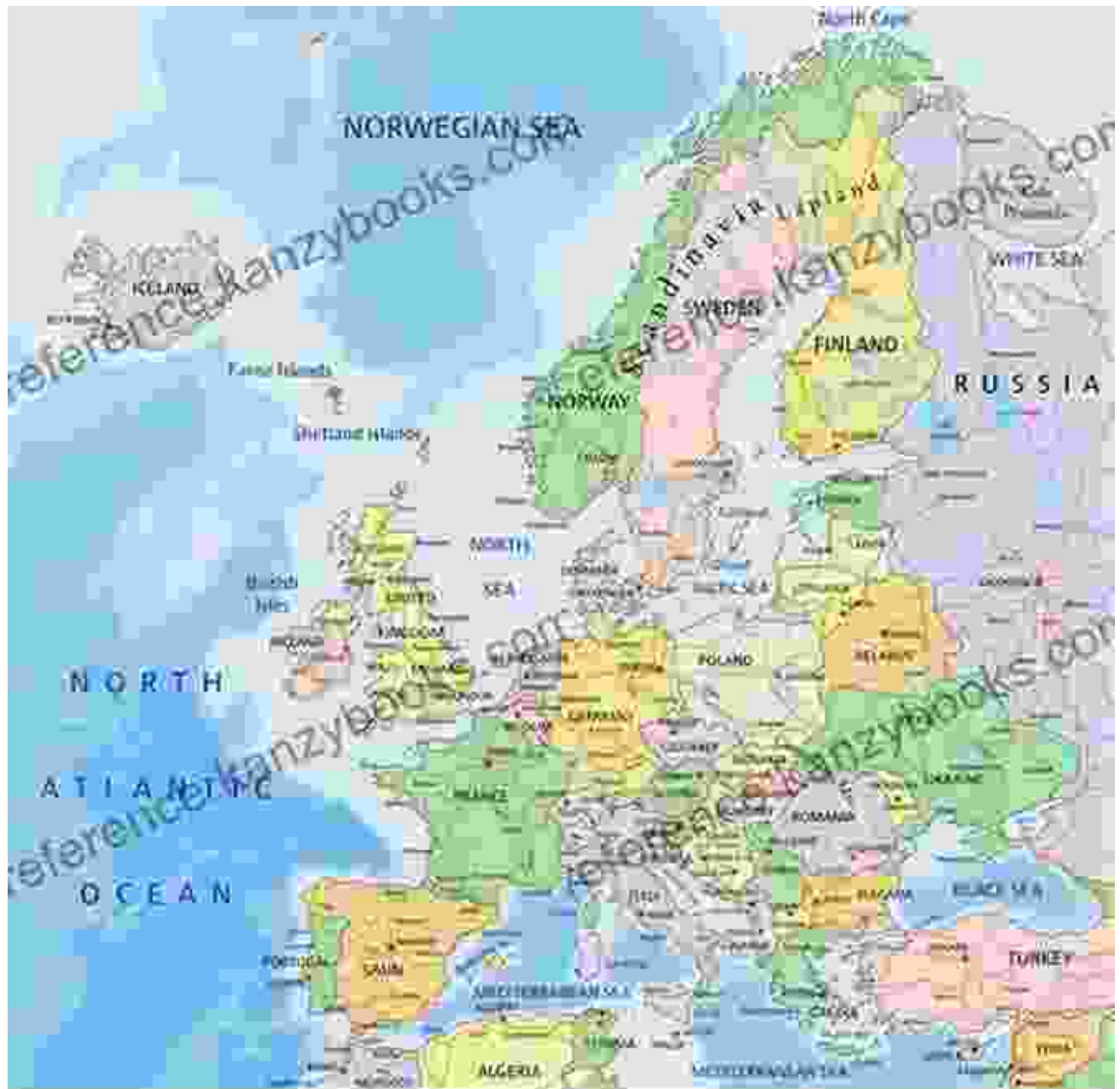
A map of Europe from "Ride Europe: The Ultimate Motorcycle Tour Guide"